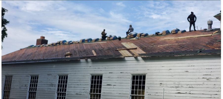
At left, the current un-restored interior of the chapel. Quite impressive for a small structure. Above, the roof work has already begun. Below, an artist's rendering of the chapel's planned exterior.